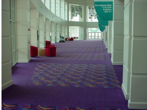
Old 'Junky' Carpet