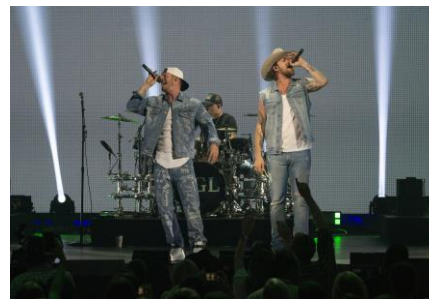
Florida Georgia Line take the stage during the 2019 iHeartCountry Festival presented by Capital One at the Frank Erwin Center on May 4.