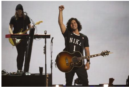
Dan Smyers of Dan + Shay smiles during the 2019 iHeartCountry Festival presented by Capital One at the Frank Erwin Center on May 4.